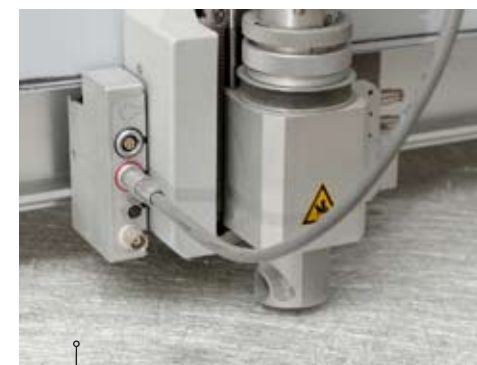
CNC Fabric Cutting