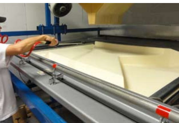
Thermoformed (Vacuum Formed) Interior Panels