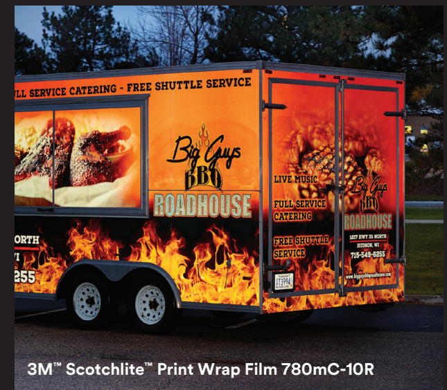
3M™ Scotchlite™ Print Wrap Film 780mC-10R