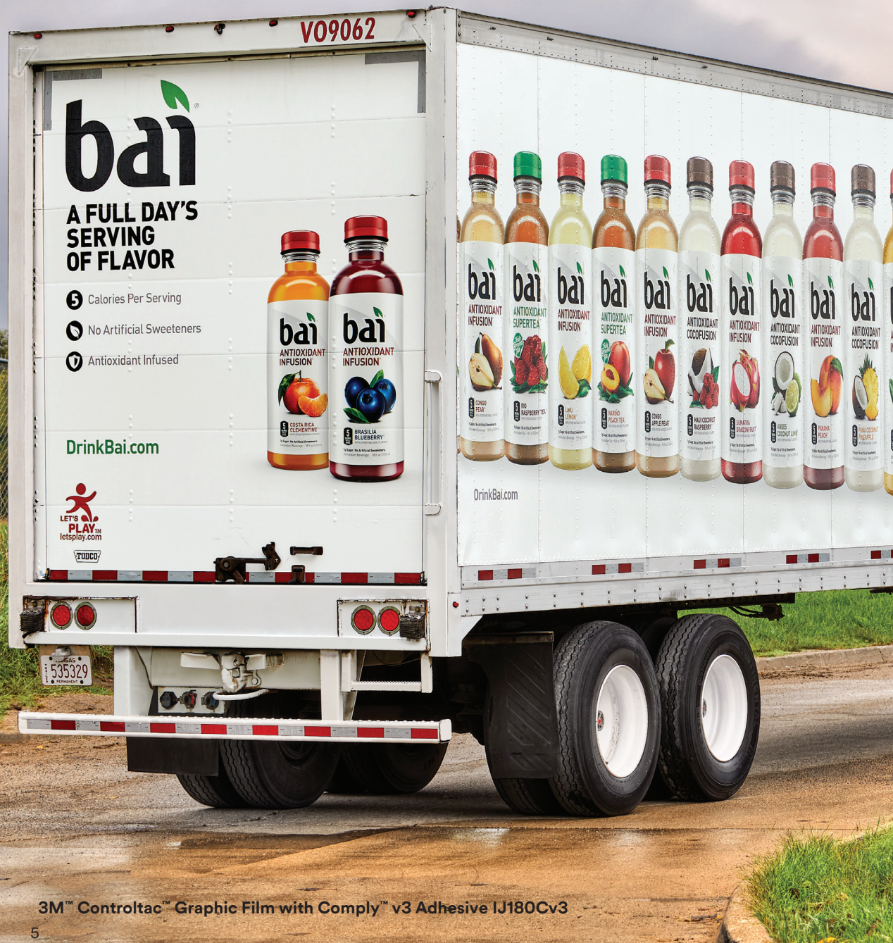
3M™ Controltac™ Graphic Film with Comply™ v3 Adhesive IJ180Cv3

From passenger vehicles and cargo vans to box trucks and trailers, 3M's broad portfolio of films provides versatility for applications across your entire fleet. We invest heavily in research and development as well as conduct extensive testing to deliver advanced film technology and performance. Films with 3M™ Comply™ Adhesive and 3M™ Controltac™ Technology allow easier and faster installation and removal of your graphics.