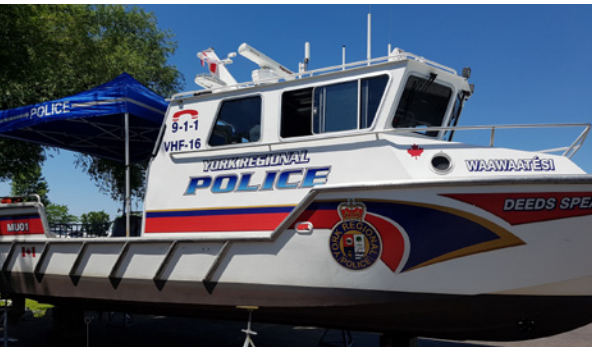
Regional Police Watercraft

Partial or full vehicle wraps available. Consider your vehicle a moving billboard.