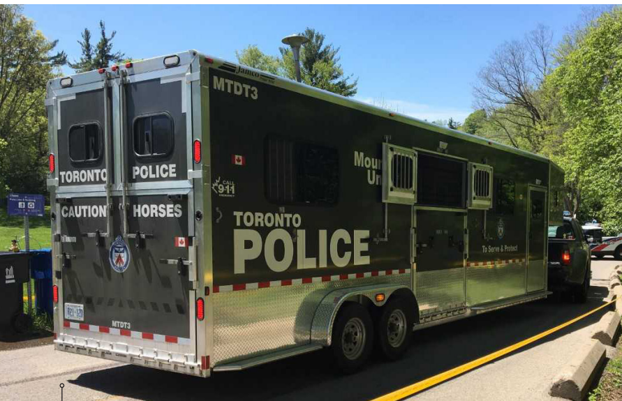
Police Mounted Unit Horse Trailer

Graphic films offer maximum versatility covering the gamut of vehicles from: