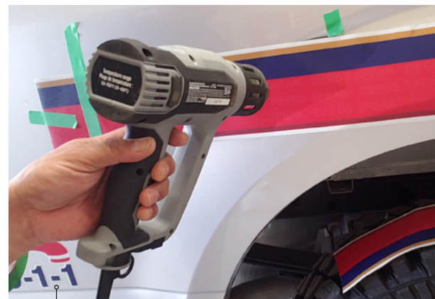
Heat Gun Application

Choose an industry recognized 3M Preferred Installer to ensure successful graphic application