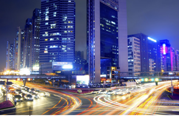
Be seen at night