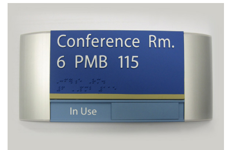
Photopolymer Architectural Braille