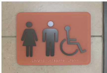
ADA Method Engraving