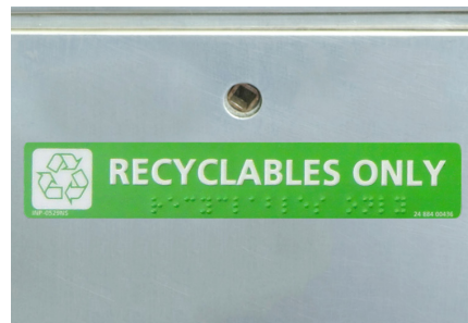
Embossed Polycarbonate Lexan