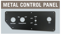
METAL CONTROL PANEL